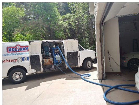
Holiday's professional direct-drive truck mount system that is better at removing stains and extracting debris deep in the fabric than anything that can be rented or bought.