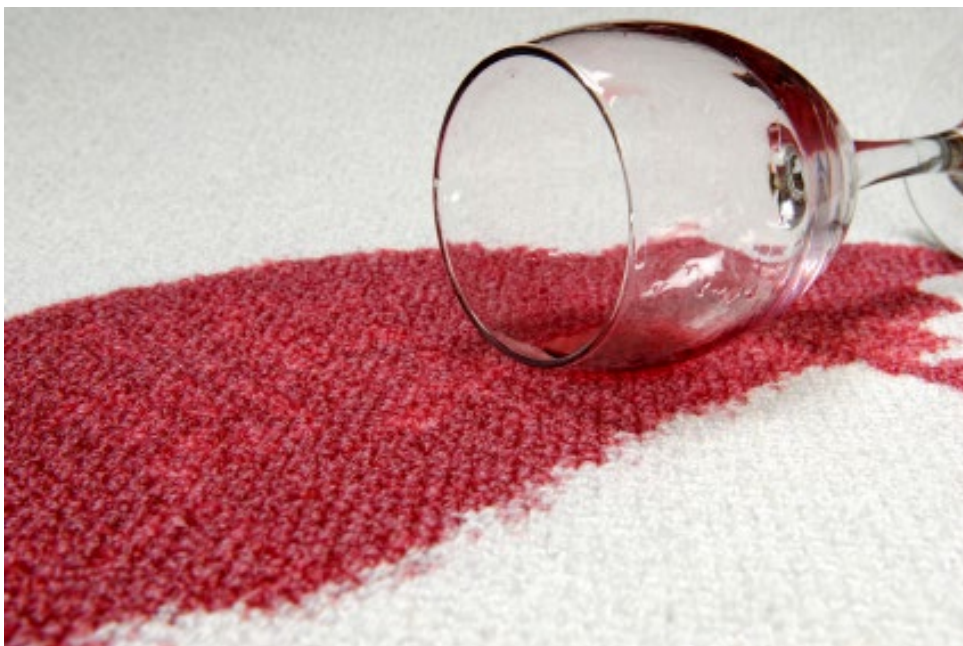
Wine stains, coffee stains and pet accidents: What can be done to restore the cleanliness desired?