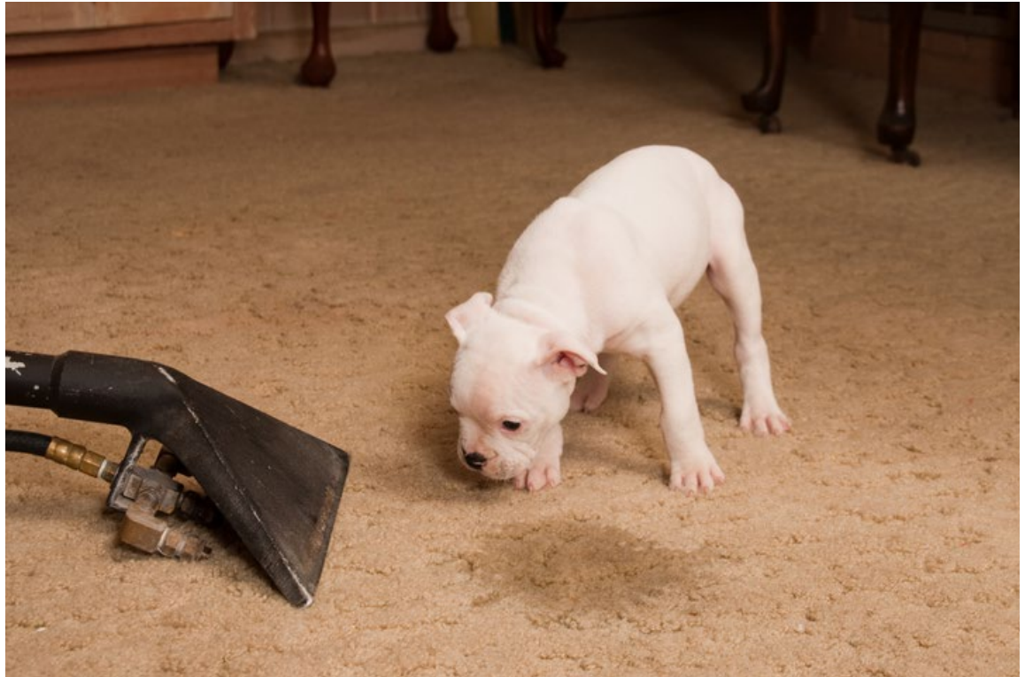
Accidents happens: Not to worry, Holiday has the deep cleaning steam extraction method to battle everyday life.

Not only are fabric sofas fashionable, but they can also be very cozy. However, spills are going to happen from time to time and dirt and dust can collect on it. That's why you're going to need to learn how to properly clean it.