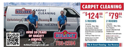
Front of Coupon from ValuPak

Thank you for reviewing our new quarterly newsletter. We will try to introduce cleaning tips that can help keep a clean house.