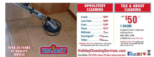
Back of Coupon from ValuPak